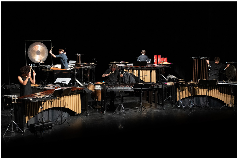
Diablos & Démons (création mai 2022)