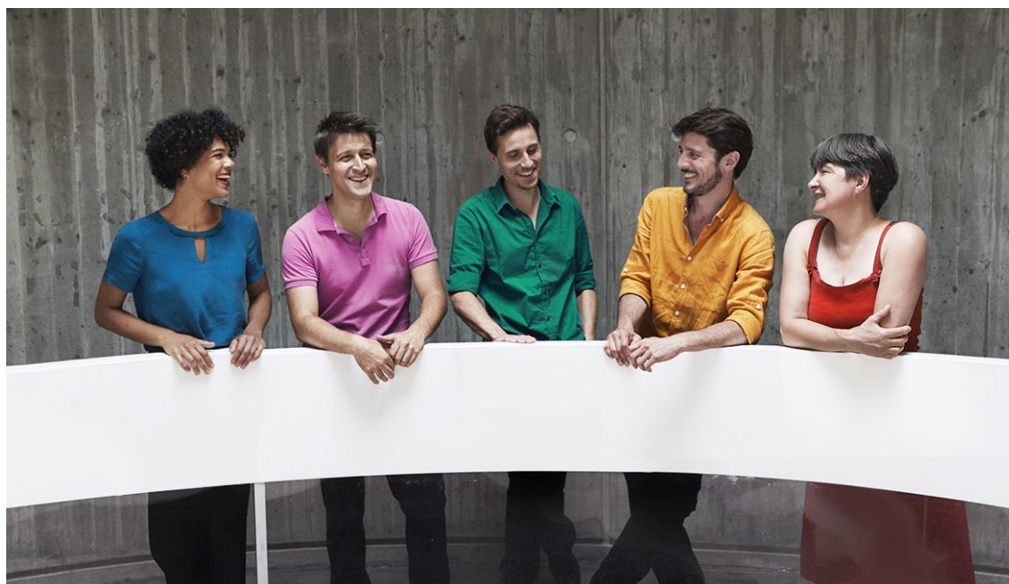
Percussions Claviers de Lyon Photo taken at the Lugdunum-museum & Roman theatres

The Percussions Claviers de Lyon is subsidized by the Ministry of Culture - DRAC Auvergne-Rhône-Alpes, the Auvergne Rhône-Alpes Region and the City of Lyon. The ensemble receives support for their concert, performance and recording activities from SPEDIDAM, SACEM, FCM, ADAMI and Musique Nouvelle en Liberté. The Percussions Claviers de Lyon is a member of FEVIS, PROFEDIM, Bureau Export and Futurs Composés. Companies La Nouvelle Imprimerie Delta, Les Ateliers Guedj and Resta-Jay Percussions are partners of the ensemble..