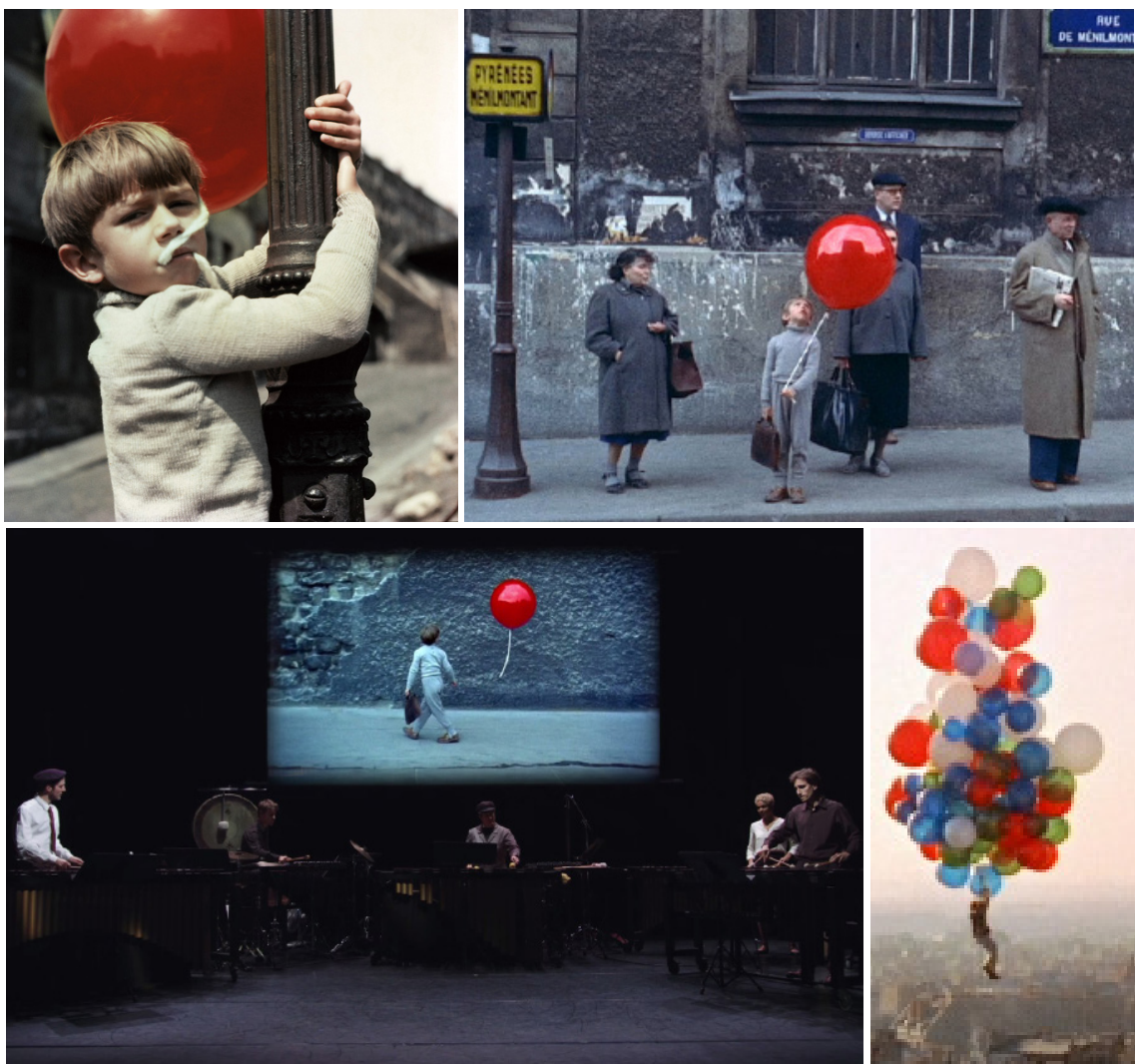
Le Ballon Rouge / Picture of the film concert